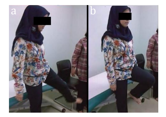
Figure 2. (A,B) Clinical examination of a female patient after CoC total hip replacement. The patient had no difficulty to perform hip extention and abduction