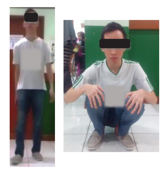
Figure 4. Clinical patient 6 months post-surgery in case 3

head remained vital. The patient was diagnosed with non-union fractures accompanied by deformity. The patient had a diabetes mellitus.