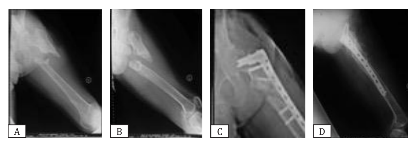
Figure 5. (A,B) Case 3. X-rays of the neglected proximal femur fracture subtrochanter; (C,D) X-rays of post-operative