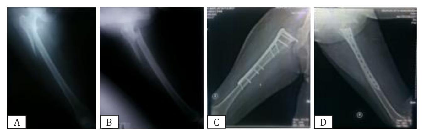
Figure 6. (A,B) Case 4. Pre-operative X-rays; (C,D) Six-month post-operative radiograph

the systemic conditions and preparation for the operation. Thus, no definitive surgery was performed less than 48 h after the initial injury. While waiting for the definitive surgery, the patients experienced prolonged immobilization. One neglected case patient waited for more than six months. Pre-operative problems including the timing of definitive surgery, accompanying injuries, long immobilization, general conditions, such as a history of shock, will affect the healing process of the bone and soft tissues.