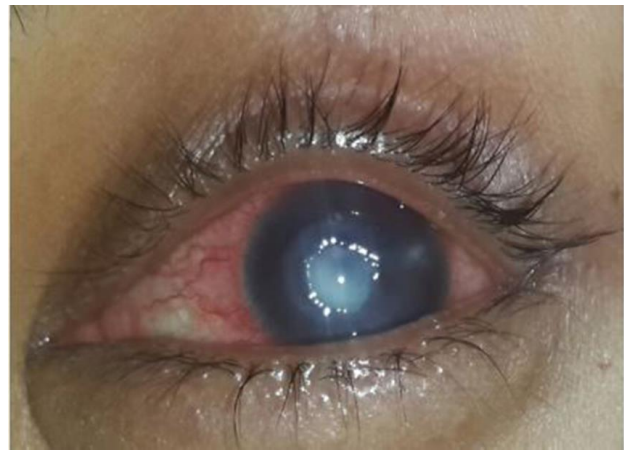
Figure 1. The initial clinical appearance of the left eye showed a semi-circular central ulcer with an area of 5.8 mm with 1/3 stromal depth, surrounded by a feathery-edge infiltrate and satellite lesions

The visual acuity of the left eye was light perception with wrong projection and the right eye was 6/6 with correction. Examination of the left cornea showed a semi-circular central