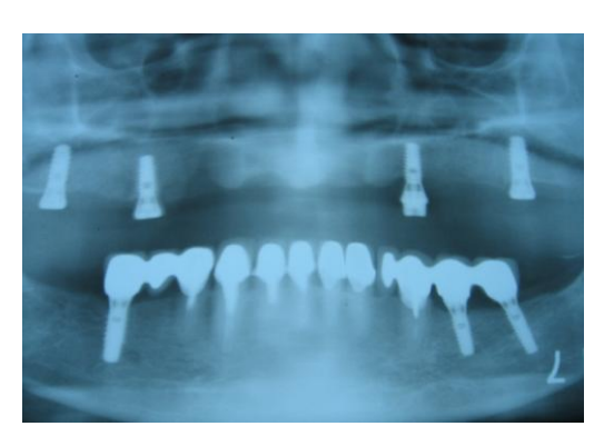
Figure 9. After treatment (2005)