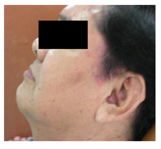
Figure 13. Patient's profile in his new upper and lower denture