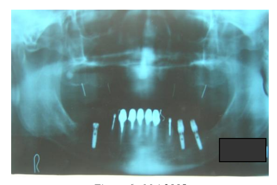
Figure 6. Mei 2005