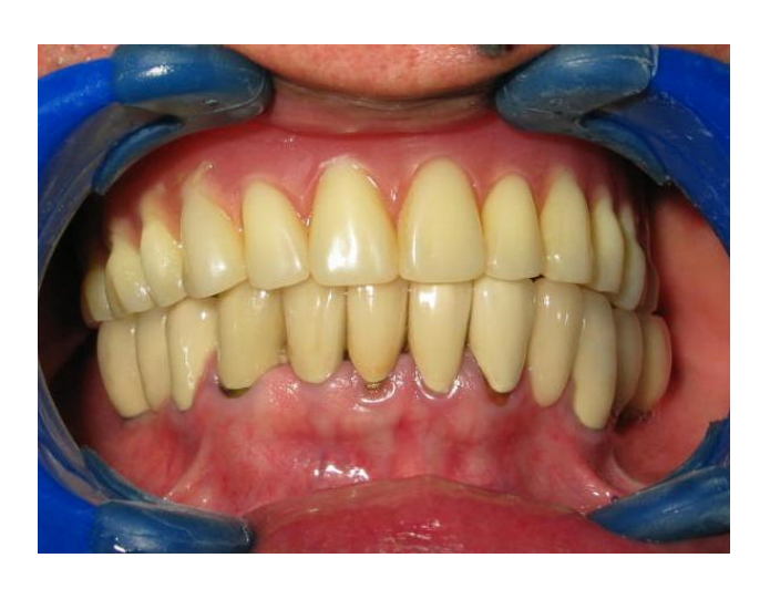
Figure 14. Upper and lower new denture