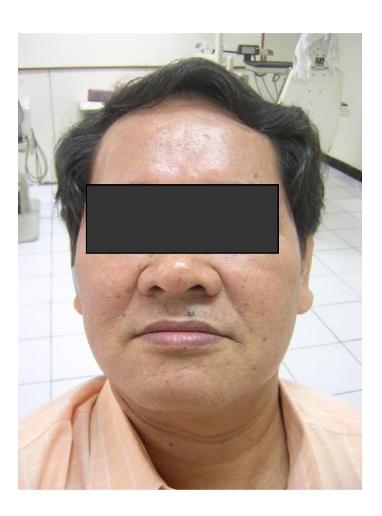
Figure 3. Patient's appearance in his old upper and lower denture