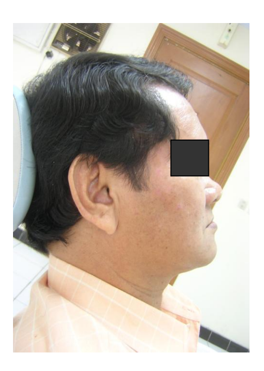
Figure 4. Patient's profile in his old upper and lower denture