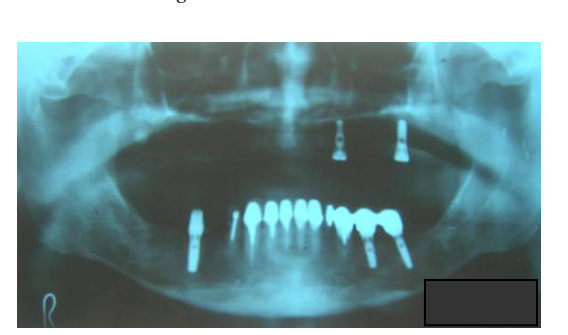
Figure 7. July 2005