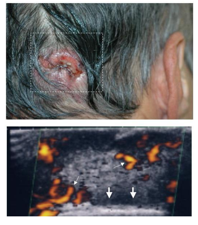
Figure 1. Image from case 1: Basal cell carcinoma. An ulcerated skin lesion was found in occipital region (upper). Its ultrasound image reveals a mass with marked neo-vascularization (lower, thin arrows) surrounded by a clear border (lower, bold arrows).

progressively ulcerated (Fig.1, upper). Physical examination revealed a 40 x 40 mm dome-shaped ulcerated mass with inferior induration measured 50 x 50 mm that seemed to be fixed to the bone. Clinical findings suggested a malignant skin tumor with suspicion of a bone invasion. Ultrasound examination was performed to evaluate tumor dimension, its depth of penetration and vascularity. The echogram detected an echogenic mass surrounded by hypoechoic border clearly indicating that there was no attachment between the tumor and periosteum (Fig.1, lower). Doppler examination demonstrated marked vascularization within the tumor indicating a malignancy. Pathological finding confirmed a basal cell carcinoma. Further assessment by computed tomography (CT)-scan and magnetic resonance imaging (MRI) has also confirmed no bone invasion. Treatment was done by radical excision and the tissue defect was reconstructed with a transposition flap.