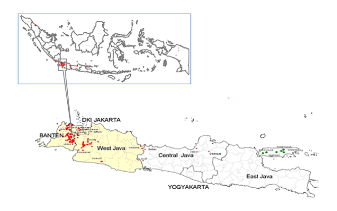
Figure 1. Location of study area

Figure 1 shows the location of the study areas in three districts in the western part of Java Island.