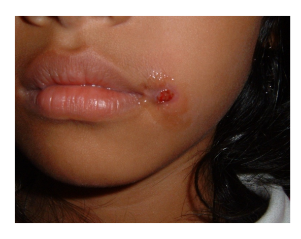
Fig. 2. A 12 year-old girl has had a small granulating wound since a year before presentation. Surgical removal of the wound revealed also 2 pieces of bamboo inside the chronic wound

Wound with foreign bodies cannot contract, repopulate the area with capillaries, or completely epithelialize (depending on the size and location of the foreign bodies).<sup>1</sup> The author has an experience on a 12 year-old female patient who came with small ulcer just next the left commissural. (Figure 2) She had been suffering from that recalcitrant granuloma for a year and been shopping for doctors and clinics but never healed. Exudation and pustulation had been waving on the presentation of the chronic granulating tissue that never healed. Simple excision of the ulcer revealed two pieces of bamboo in the chronic wound, and simple suturing healed the wound uneventfully. Other example that quite common encountered by plastic surgeons is the infected implant in situ. The only treatment that is effective to heal the wound is to remove the implant with subsequent repair of the resulting defect.