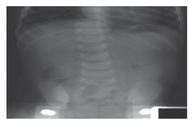
Figure 2. Plain film of the abdomen taken at three months postoperatively showed no sign of intraabdominal calcifications.