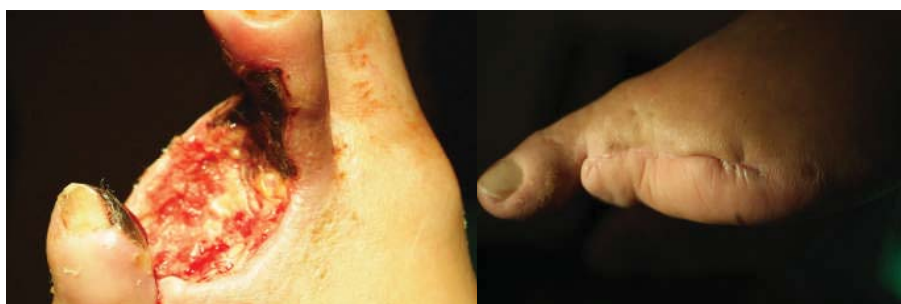
Figure 3. Bone marrow stem cell therapy in diabetic foot (Bad Oeynhausen Working Group, Germany). This patient had a chronic limb ischemia with forefoot necrosis. Distal stenosis A. tibialis anterior and A. dorsalis pedis without collateralisation was verified by angiography. Discussion between vascular surgeon, intervention angiologist and internist revealed no surgical or interventional therapeutic option. Due to the stenosis location and vascular structure, no possibilities to perform bypass or other intervention were seen. The patient agreed with the autologous bone marrow stem cell therapy. Left picture shows the wound status before intra muscular stem cell transplantation. Right picture shows the complete wound healing 20 weeks after stem cell transplantation. Small calibre new vessel formation was proved by angiography. (With permission from Kirana, Stratmann et al. Wound therapy with autologous bone marrow stem cells in diabetic patients with ischaemia-induced tissue ulcers affecting the lower limbs. Int J Clin Pract 2007;61:690-2)