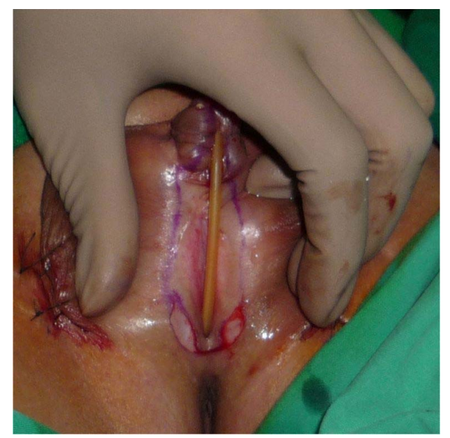
Figure 3. Incisional wound with minimal bleeding

when the patient underwent secondary chordae release and intra-glans urethral reconstruction. The surgery was considered a success after a 6 month follow-up, leaving only a small urethrocutaneous fistula on the distal penile body. The author plans to repair the fistula and reconstruct the scrotal bifid after 6 months. The patient urinates by standing, leaving only dripping of the urine through a small single fistula (Inzet in figure 4 shows the penis 6 months after surgery). A movie clip is attached to this article showing the intraoperative bloodless operating field.