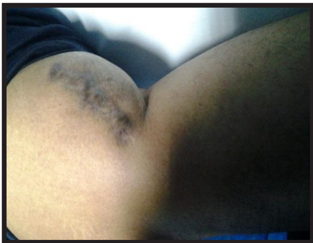
Figure 5. One year follow-up

Early success in terms of ablation of the refluxing vein is about 90-95% with EVLT. 9 The success of EVLT has been shown to be dependant upon the amount of laser energy delivered, with no occlusion and early re-opening of the GSV seen more frequently using energy less than 70 J/cm. 10,11 Recanalization after thrombotic occlusion seems to be the factor causing procedure failure. Long term failure such as persistent or recurrent reflux or patency of treated saphenous vein segments, has also been shown to be related to non treatment of large tributaries or perforating veins. 12 Compared with conventional stripping, significantly decreased post-operative pain, faster return to normal activity, superior quality of life and overwhelmingly better patient acceptance with equal efficacy of treatment have been demonstrated with this minimally invasive technique. One year follow up in this patient showed improved symptoms and signs (Figure 5). Future developments in this field must mandate standardization of technical aspects, follow-up imaging and reporting of this minimally invasive technique of superficial venous ablation. 1,13