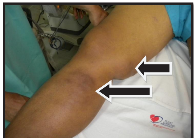
Figure 1. Varicose veins

hospitalization, he complained of pain on his right lower limb varicose veins. Pain was exacerbated with movement and direct pressure. He had varicose since five years ago with no prior symptoms. He also had hypertension, diabetes mellitus, and dyslipidemia, which were treated with amlodipine, metformin, pioglitazone and simvastatin. He had been given micronized, purified flavonoidic fraction. Physical examination revealed inflammation on varicose veins just above right popliteal region and medial part of proximal right tibial region (Figure 1). Lower limb arteries pulsation were equal and normal. ECG was normal sinus rhythm. Chest X-ray revealed elongated aortic segment with no sign of cardiomegaly and congestion. Laboratory results found no sign of infection, D-dimer was normal with blood