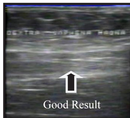
Figure 3. Excised aneurysmatic varicose vein & ultrasound follow up of GSV