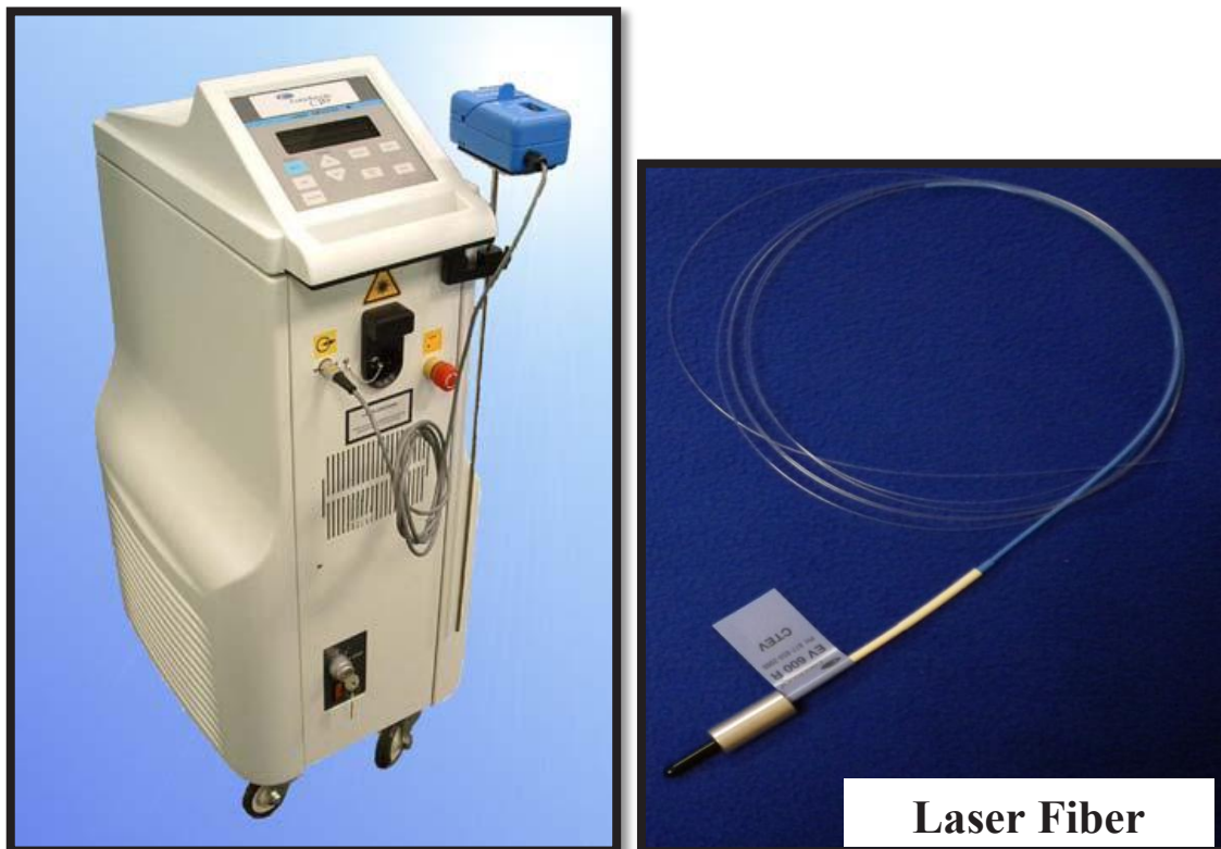
Figure 4. Endovenous laser equipments

Patients undergoing EVLT more likely to have tight and pulling sensation along the medial thigh that is secondary to thrombotic occlusion of the vein and thrombophlebitis. The more serious complications of deep venous thrombosis (DVT) and extension of thrombus into the femoral vein, but pulmonary embolism is extremely rare. There is a learning curve, with decrease in the incidence of all complications with experience. 8 In this patient no complications occurred.