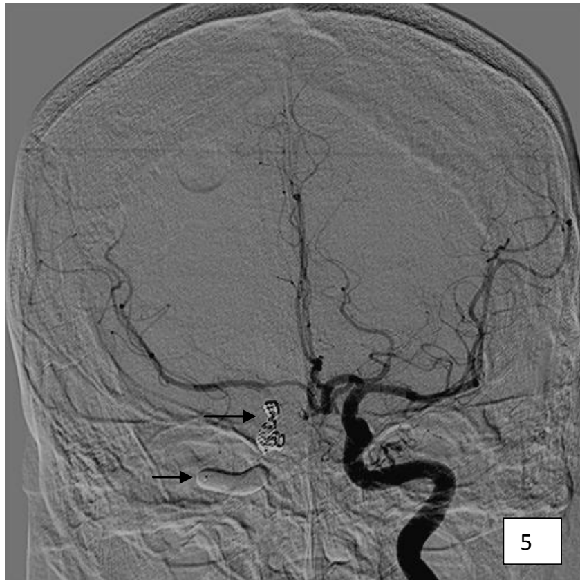
Figure 5. Final angiogram via left carotid artery post posterior coiling and glue (arrow) and balloon occlusion at the proximal right carotid artery (arrow head) showed trapping of right fistula's flow. The right intracranial flow was maintained via collateral from the left carotid circulation

Most of the reported success rate of conventional endovascular treatment of direct CCF using detachable balloon or platinum coils are about 75%-88% with preservation of the main carotid artery. 4,6 For the rest of the cases, the occlusion of the main carotid artery is contrived to treat the fistula. Cases which are treated by occlusion of the main artery inherently have large tear in which the flow of carotid artery is profoundly terminated in the cavernous sinus.