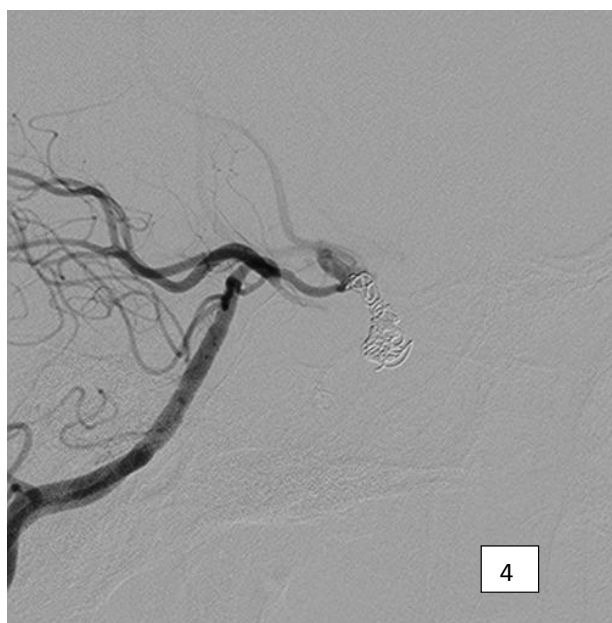
Figure 4. The short portion of pre-clinoid carotid artery was totally occluded after delivery of 50% histoacryl glue into the pre-existing packed GDC coils. A subsequent closing of the anterograde filling of the fistula was performed by proximal carotid occlusion with detachable balloon

due to balloon migration anteriorly or posteriorly, in which rapid aggravation of ophthalmic symptoms or intradural complication such as bleeding can occur. 5-7