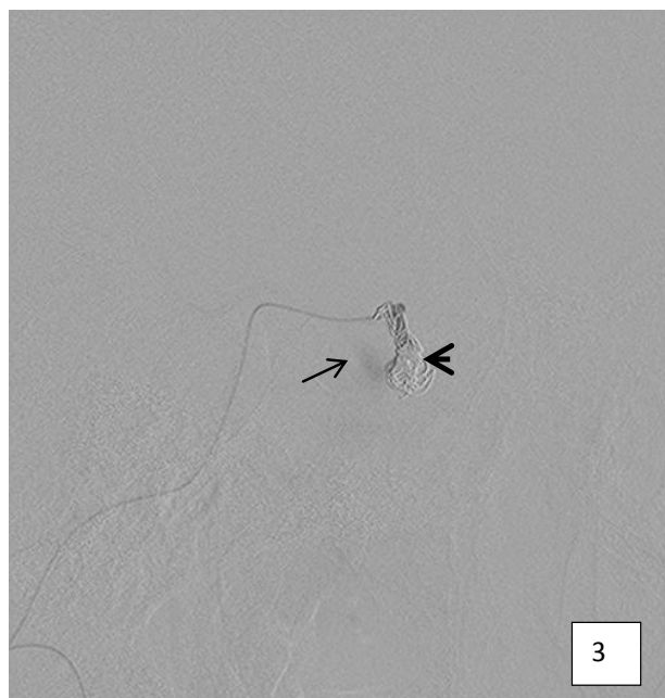
Figure 3. Post delivery of 2 GDC microcoils (arrow head) to the pre-clinoid carotid artery. Angiogram via microcatheter in the PCOM showed minimal filling to the fistula at the posterior aspect (arrow)

Direct CCF is considered as a progressive neurosurgical case which needs an early diagnostic ruling with prompt management. The indications for urgent treatment of CCF include the following :1) progressive visual loss, 2) epistaxis, 3) sphenoid sinus aneurysm, 4) comatose patients in whom intracranial lesions have been excluded, 5) re-routing of the venous drainage