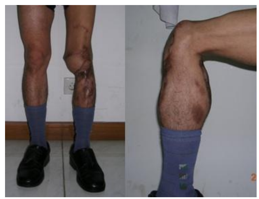
Figure 4. There was no local recurrence and range of movement of the knee was 0-90° at fifteen month follow-up

sarcomatous growth next to areas of benign GCT.<sup>3,5,9,10</sup> It is very rare and considered as a representation of dedifferentiation in GCT,4 approximately 5 to 10% of GCT cases. 2,10