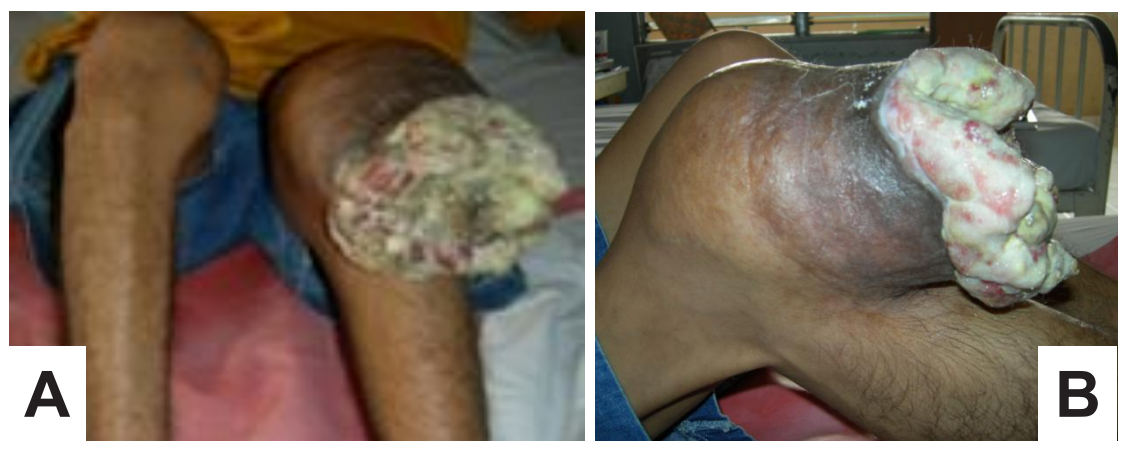
Figure 1. Ulcerated tumor at left knee, anteroposterior (A) and lateral (B) view. Big tumor at the patellar bone accompanied with necrotic tissue in large ulcer at lower part of the tumor, no swelling or edema in distal part of the extremity (compared with contralateral side)

Patient underwent limb sparing surgery with total patellectomy and reconstruction of the extensor