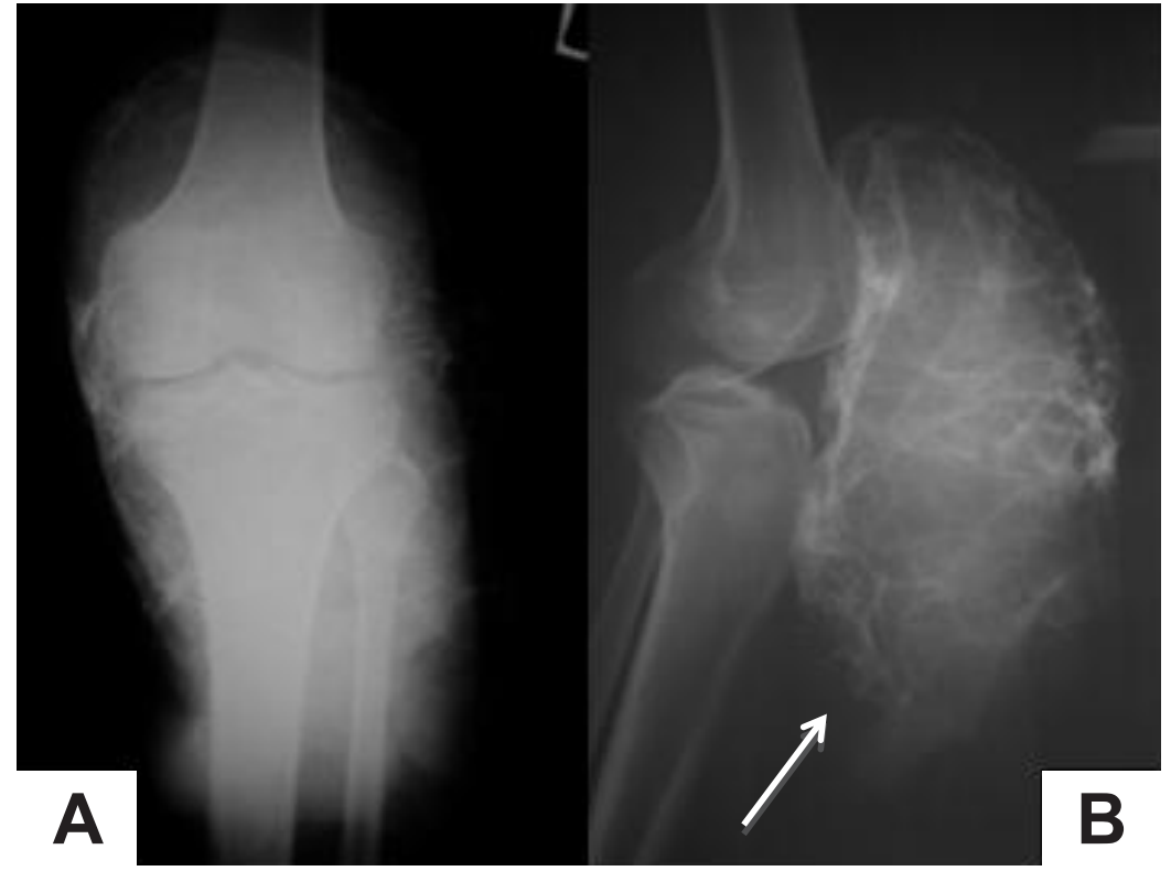
Figure 2. Radiographic pictures. Anteroposterior (A) and lateral (B) projections showed an expanding area of lytic lesion, multiple septations (soap bubble appearances), and destruction of the lower pool of patella (white arrow)