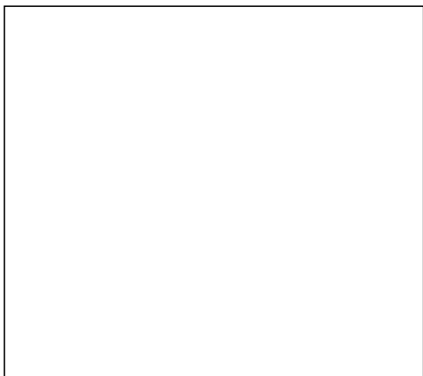
Figure 3. Axial CECT scan shows multiple small cystic lesions in the corticomedullary junction of both upper parietal lobes. No edema is present and no cyst wall enhancement is seen. The picture represents the vesicular stage of infection.