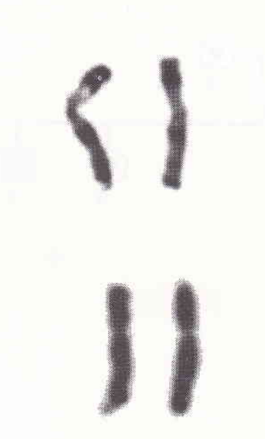
Figure 1. Fragile X chromosome (left) and normal X chromosome (right) in female (cl)

room temperature for 20 minutes and then twice for 30 minutes at 65°C in 0.1x SSC and 0.1% SDS. Autoradiography was performed for 1-3 days at -70°C using intensification screens.