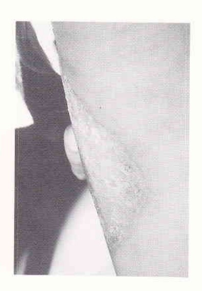
Figure 5 and 6. After 3 weeks of therapy, all lesions either on the dorsum pedis or on the upper thigh showing improvement.

anergic reaction.<sup>4</sup> Tuberculin skin test (PPD 5 TU) in our patient was strongly positive with a diameter of 20 x 20 mm erythematous induration. This confirmed a hyperergic reaction.