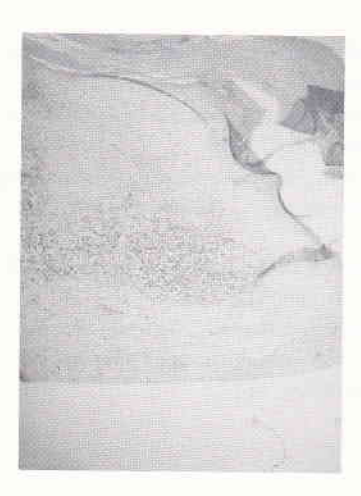
Figure 3. Skin biopsy from a distal part of dorsum pedis revealed hyperkeratosis, acanthosis with Langhans cells, chronic inflammatory infiltrates, and some epitheloid cells in the dermis.