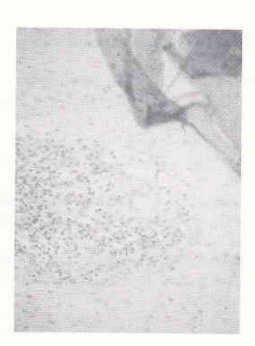
Figure 4. Figure 3 from close up.