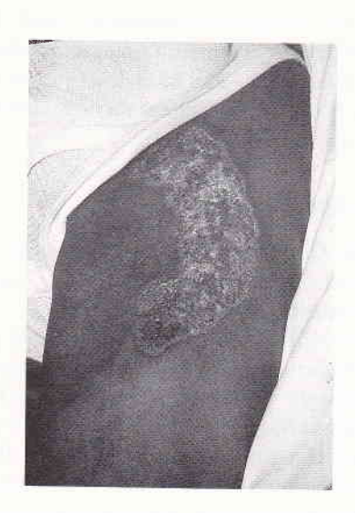
Figure 2. A serpigineous hyperkeratotic plaque on the anterior part of the right upper thigh.

Significant laboratory findings were an elevated blood sedimentation rate of 86/h and acid fast bacilli were found in the sputum. Other laboratory findings within normal limits.