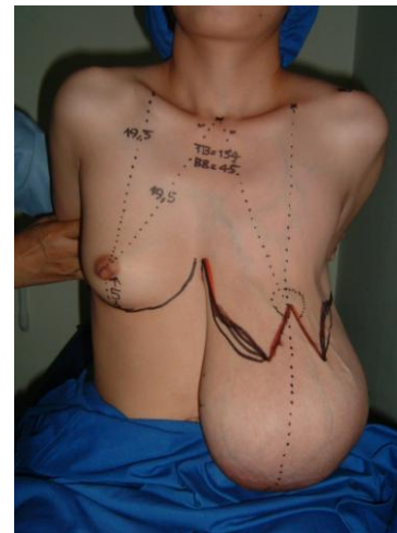
Figure 2. The design of the surgery to reduce the hypertrophic breast using a modification of the Wise pattern technique (With the permission from the patient)

With the patient erect, the breast meridian is established by dropping a line from the midclavicle through the nipple and continuing inferiorly across the inframammary line. The level of the inframammary fold is transposed to the anterior breast and marked on the breast meridian. It was also confirmed to be 19,5 cm as per normal contralateral breast from midclavicular or sternal notch point. Diverging lines as the limbs of the pattern are drawn from this key point and pass as, if they are lengthened, tangents to either side of the dilated areola. Both lines is measured 5 cm as it follows the meridian line of the normal contralateral breast from nipple to inframammary line. Instead of making a wire keyhole pattern, a circular design of 35 mm diameter encircling the future nipple position is drawn to be deepithelialized later. From the limbs of the pattern, lazy S based lines are directed medially and laterally to intersect the inframammary fold, which has also been indicated.