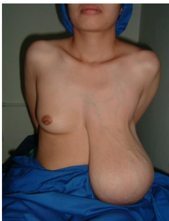
Figure 1. Pre operative condition of the patient (With permission from the patient).

A thirty year-old woman weighting 45 kg and 154 cm in height, came with a chief complaint of having a severe breast asymmetry. The enlargement of the left breast started 15 years ago during her prepubertal age. Despite of having enlargement of both breasts, her left breast enlarged more rapidly and progressively. After 3 years the growth of the left breast gradually ceased. She had one child and there was no rapid enlargement on the affected breast during pregnancy. Her left breast did not produce milk after parturition. There was no history of taking any hormonal medications nor prolonged NSAID consumption. Her past medical and family history was unremarkable. Examination revealed a woman with an ideal body shape with huge and pendulous left breast that almost reached the pubis in standing position. The skin of the affected breast was thin with prominent superficial veins and dilated nipple. There was no discreted mass felt, no nipple discharge, and no lymphnodes enlargement. There were no abnormalities on her blood test. In April 2004, she underwent a reduction mammoplasty with a free nipple graft. The result is very satisfying. Both breasts are symmetrical with a minimum scar.