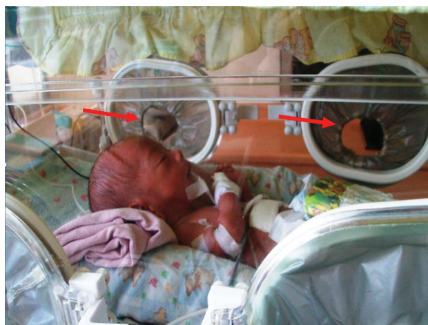
Figure 2. Incubator's attached gloves (red arrow)

P. aeruginosa isolated from blood (328/330) and tracheal aspirate (356), from different patients in 3 weeks interval showed identical antibiograms profile, suggesting those were the same strains which present and colonized the unit (see Table 4); these clinical specimens originated from neonates in SCN 1 (Figure 1). Most of P. aeruginosa isolates from water were susceptible to almost all antibiotics tested, suggesting these isolates were not playing a role in the HAI-BSI cases. One isolate (76) from water, however, showed high similarity of its antibiogram to those of two isolates from blood (328/330) and tracheal aspirate (356) (Table 4), suggesting they might share clonality. We also found P. aeruginosa from the buttons of an infusion pump located in the NICU room (Figure 1) and hands of neonates whom placed in 4 different rooms (Figure 1). Antibiograms of this isolate showed three or more differences in their susceptibility (Table 4). However, their role in the transmission of infection could not be excluded yet. Further studies employing molecular approach such as genotyping are more than needed to confirm of whether these P. aeruginosa isolates were the same strain. Molecular typing is needed as well for the E. asburiae from neonates' blood.