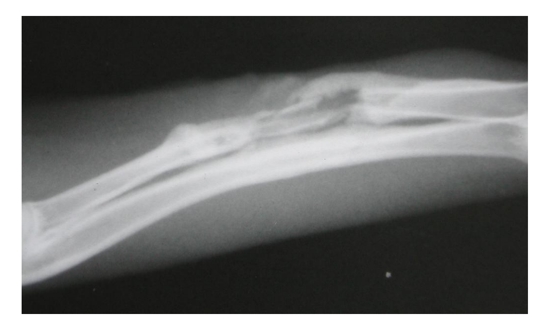
Figure 2. X ray of one of the samples' left radius with osteomyelitis. Osteomyelitis appearance including osteolysis, sclerosis, involucrum and sequestrum formation was found