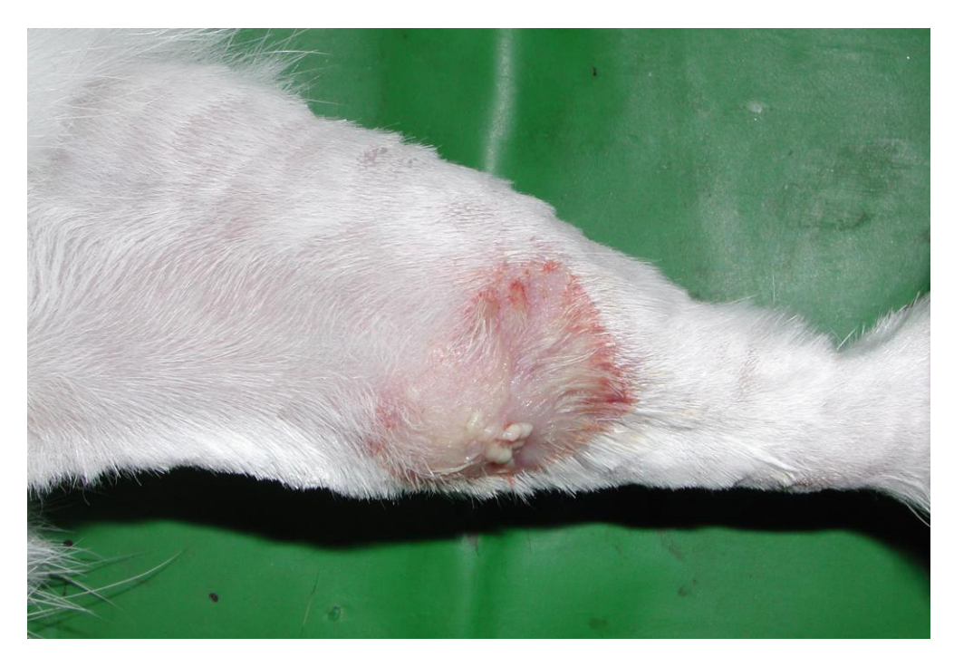
Figure 1. Clinical appearance of one of the samples' limb with osteomyelitis. An inflammation and a fistula were found