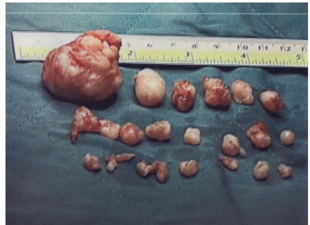
Figure 2. Multiple Myomas. The 22 myomas were removed. Their size varied between 1-4.5 cm.