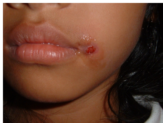
Fig. 2. A 12 year-old girl has had a small granulating wound since a year before presentation. Surgical removal of the wound revealed also 2 pieces of bamboo inside the chronic wound

Wound with foreign bodies cannot contract, repopulate the area with capillaries, or completely epithelialize (depending on the size and location of the foreign bodies). 1 The author has an experience on a 12 year-old female patient who came with small ulcer just next the left commissural. (Figure 2) She had been suffering from that recalcitrant granuloma for a year and been shopping for doctors and clinics but never healed. Exudation and pustulation had been waving on the presentation of the chronic granulating tissue that never healed. Simple excision of the ulcer revealed two pieces of bamboo in the chronic wound, and simple suturing healed the wound uneventfully. Other example that quite common encountered by plastic surgeons is the infected implant in situ . The only treatment that is effective to heal the wound is to remove the implant with subsequent repair of the resulting defect.